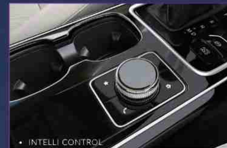
• INTELLI CONTROL

Developed in partnership with SONY Corporation, Japan, this immersive first-in-segment 12 speaker and 3D sound system is designed to take your listening experience to a whole new level.