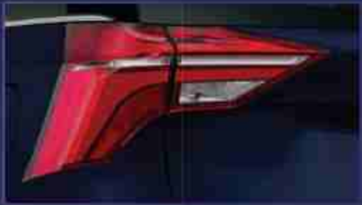
CAPTIVATING ARROW-HEAD LED TAILLAMPS