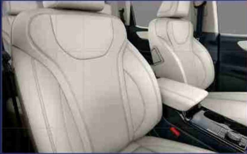
ALL-NEW FRONT VENTILATED SEATS