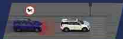
AUTOMATIC EMERGENCY BRAKING