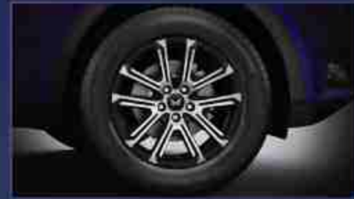
18" DIAMOND-CUT ALLOY WHEELS