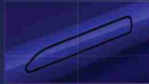
SMART DOOR HANDLES