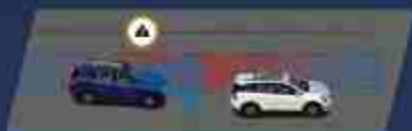
LANE DEPARTURE WARNING