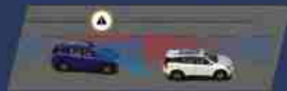
LANE KEEP ASSIST