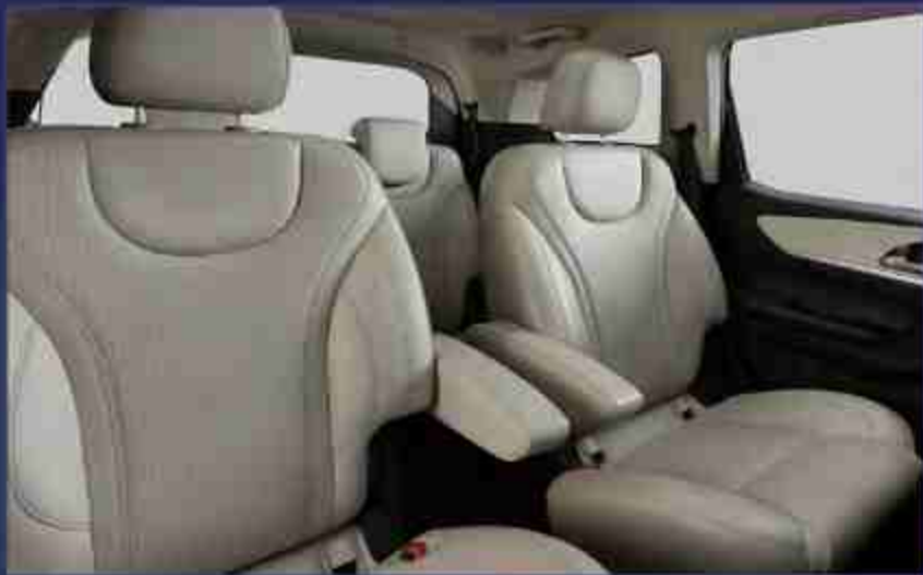
ALL-NEW 2 ND ROW CAPTAIN SEATS

Sitting in the XUV700 is a treat to all your senses. The ventilated front seats, ensure you're comfortable, even when the outside isn't. And the 2nd row captain seats give you that feeling of flying first-class, in the backseat of your SUV.