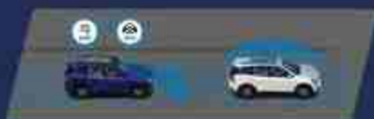
SMART PILOT ASSIST

HERE'S HOW ADAS PROTECTS YOUR XUV700 ON EVERY DRIVE: