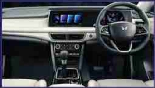
LUXURIOUS AND SOPHISTICATED INTERIORS

The Adrenox powered XUV700 is effortlessly impressive. From the style lines to the bold SUV stance, just one look is enough to get heads turning. Add the Skyroof™ and distinct LED cabin lights, and you've got an SUV that can't be ignored.