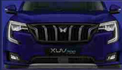
STRIKING CLEAR-VIEW LED HEADLAMPS WITH DRL AND SEQUENTIAL TURN INDICATOR