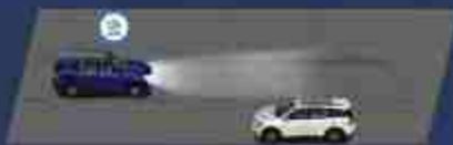
HIGH BEAM ASSIST