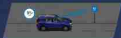
TRAFFIC SIGN RECOGNITION