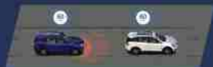
ADAPTIVE CRUISE CONTROL