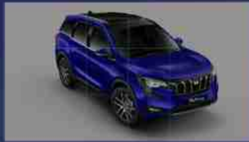
DUAL-TONE BLACK ROOF