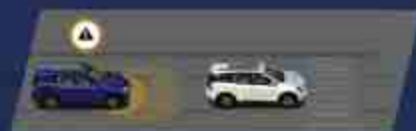
FORWARD COLLISION WARNING