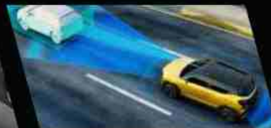
Auto Emergency Braking (Vehicles)