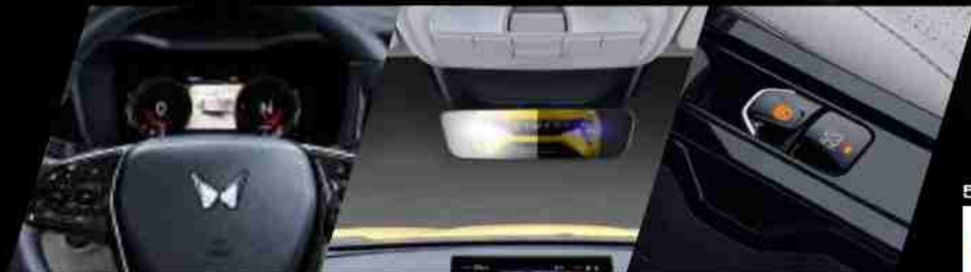
Blind Spot Monitor