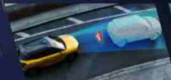
Forward Collision Warning