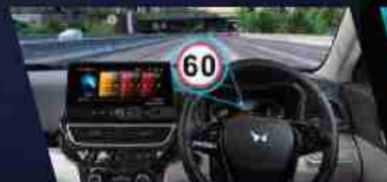
Traffic Sign Recognition