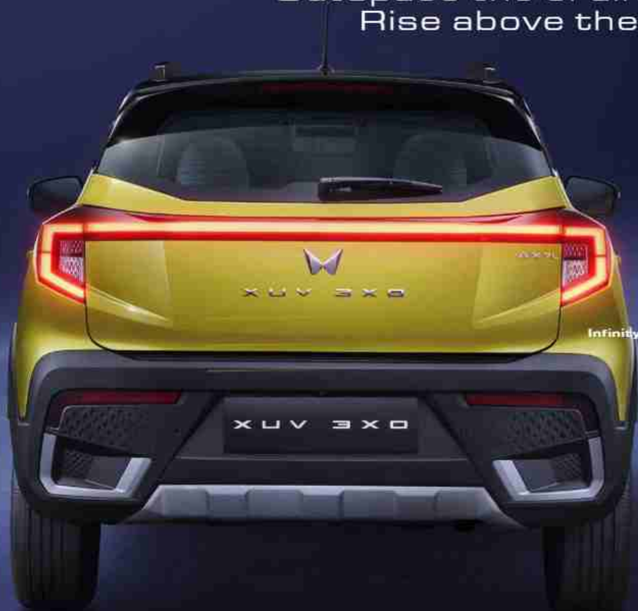
Infinity LED Tail Lamp

Outspace the ordinary. Rise above the rest.