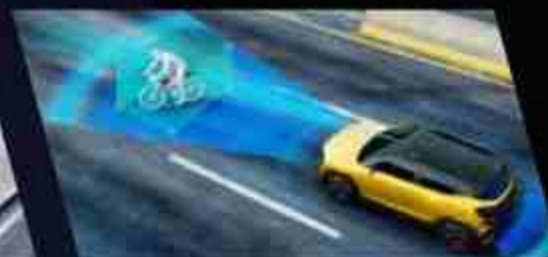
Auto Emergency Braking (Cyclist)