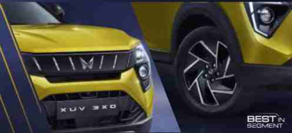
Front Grille with Piano Black Finish