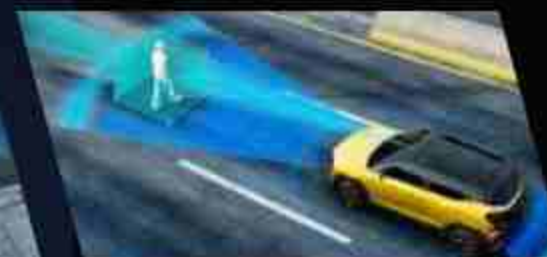
Auto Emergency Braking (Pedestrian)