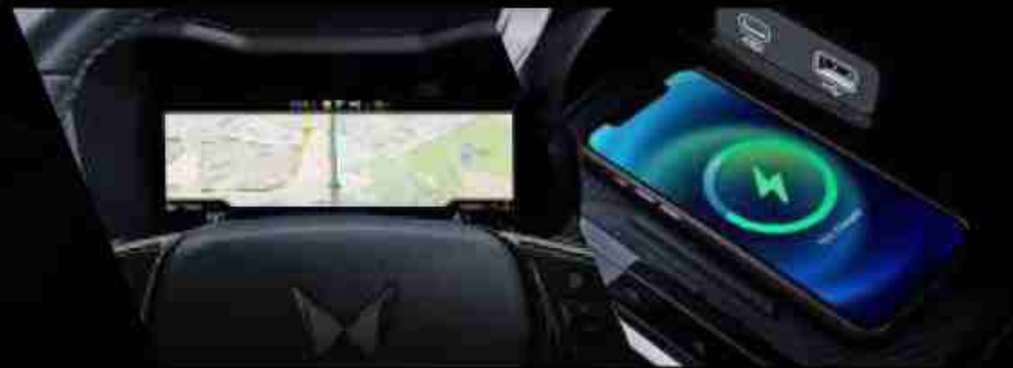
Navigation on Cluster

Tech-Driven brilliance. Engineered to impress.