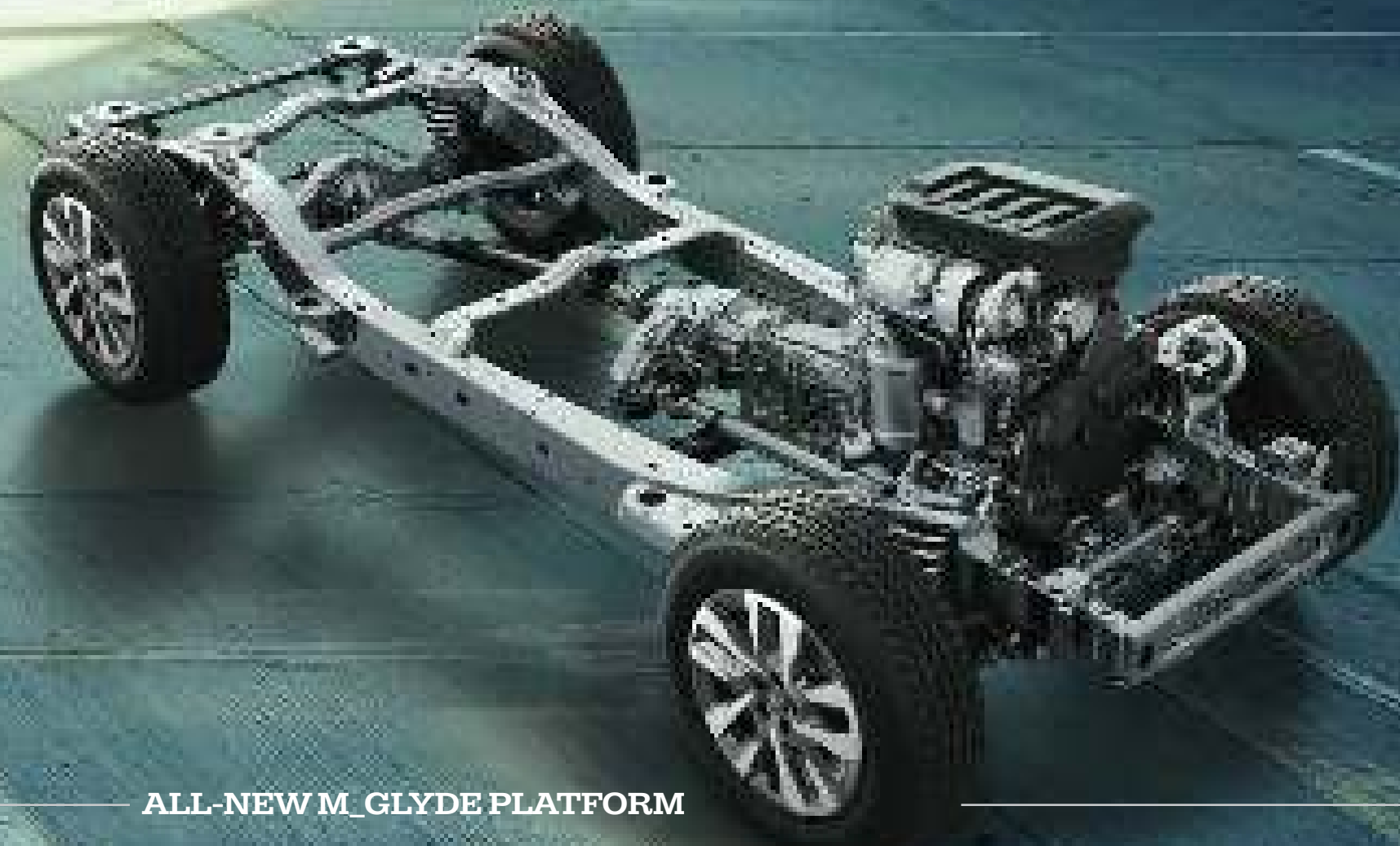
ALL-NEW M_GLYDE PLATFORM

The foundation of 'THE' SUV is its revolutionary M_GLYDE PLATFORM chassis made with high-strength steel. Solid as a rock, high on torsional stiffness and light on weight, the chassis sets a new benchmark for comfort and strength. With the highest wheelbase in the segment*, you can expect unparalleled stability and ultimate comfort. It doesn't just marry dynamics and handling seamlessly but is the reason the Thar Roxx will forever be known as 'THE' SUV.