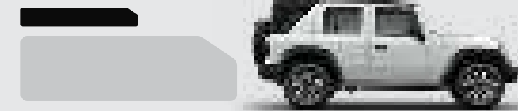
Everest White Black